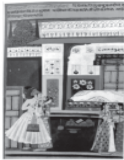
Ragini Malavi of Shri Raga, Amber Cen. 1700 A.D.

Ragini Deshakhya. This Raga presents Sringar Rasa.