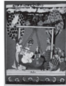
Hindol Raga, Marwar, 17th Cen. A.D.

Secondly Raga Hindol as the name applies is the Raga of Spring season that is one of ShadRitu Varnan which shows the unity of love. Dealing with Joyful Union here, raga hindol is presented as Dheer Lalit Nayak with loyally loved (swadhinpatika) Nayika on the swing which is representing