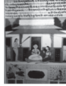
Bhairav Raga, Karamell, 1709 A.D.

From the psychological point of view a deep study of the Nayak-Nayika reflects an auxiliary sentiment which is surprising, yet according to mood. The specific Ragas associated with suitable Nayikas according to their Nature. For instance, the Dhyana of Raga Bhairav: