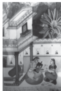
Ragini Dhanashri, Later 19th Cen. Bundi

Beginning with Ragamala , which is correlated with Shadritu, Baramasa and Nayak Nayika Bhed as a positive emotion, is productive, adds psycho value in terms of emotionality. This expression of emotion which gives fragrance to the society but the most important if it not release, it turns into abnormality. This emotional process begins with cognition than perception and only a true lover of art can observe the feeling which gives birth to emotions and results in the ecstatic exclamation of wonder over the beauty of the same.