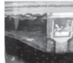
Ragini Deskar of Megh (Bihari Satsai Series) Rajasthan, Cen. 1719 A.D.

Radha and Krishana enjoying the atmosphere in Joyful Union, the Nayika here must be depicted as Swadhinpatika, in the form of Ragini Deskar.